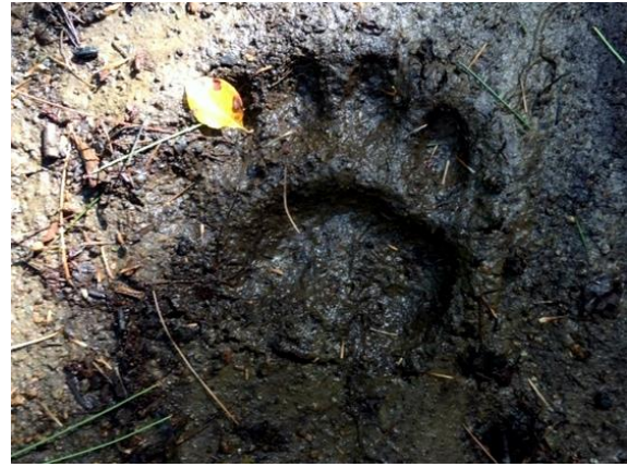
Recent bear tracks on this property